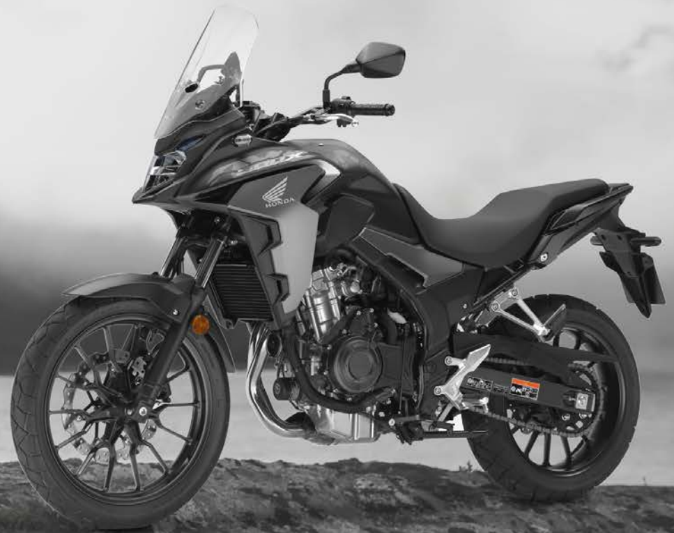
Matt Gunpowder Black Metallic