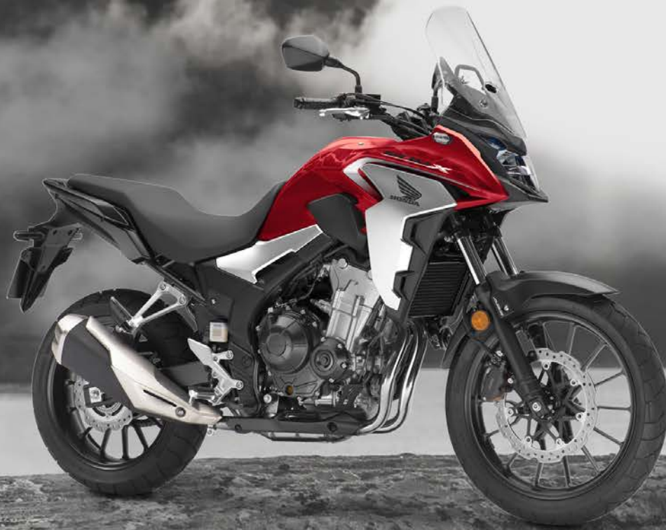
Grand Prix Red