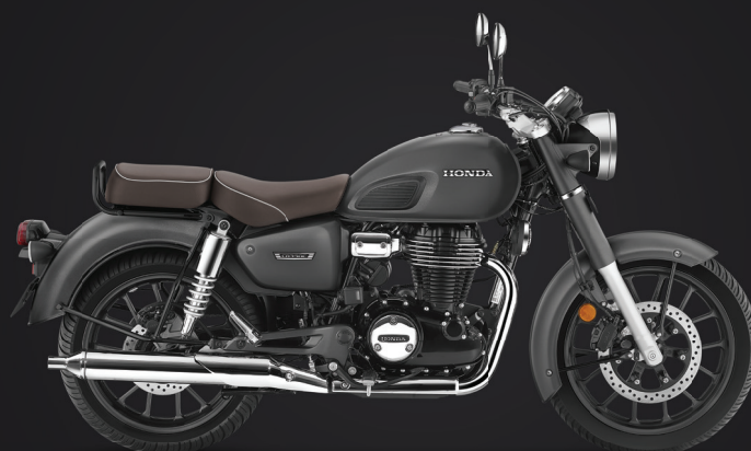
Mat Axis Gray Metallic New