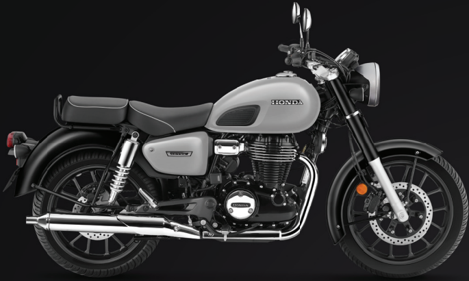
Pearl Deep Ground Grey New