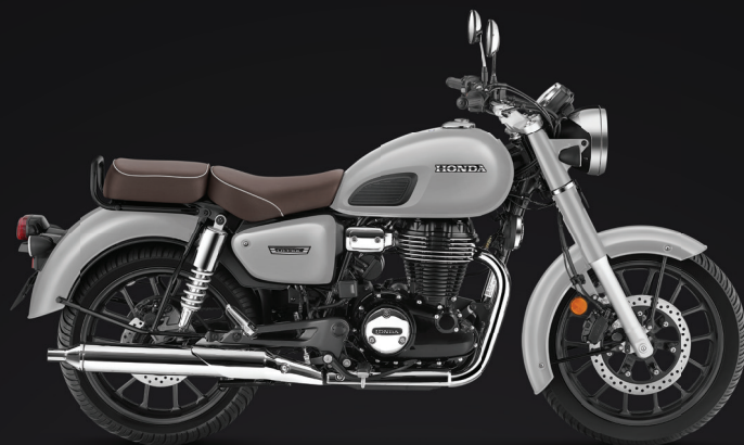
Pearl Deep Ground Gray New