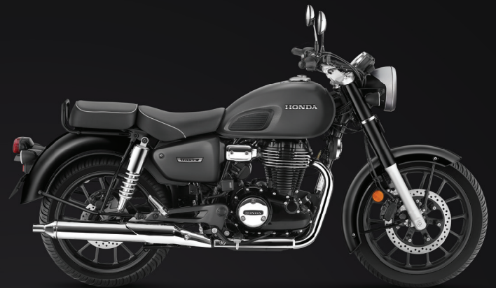
Mat Axis Grey Metallic New