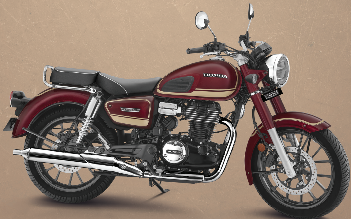
Rebel Red Mettalic