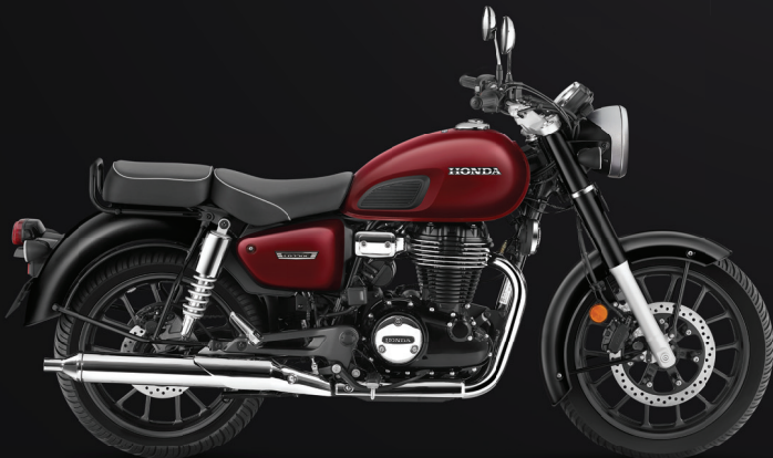
Rebel Red Metallic 2